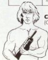
Corporal Lance (Code name: Scorpion)